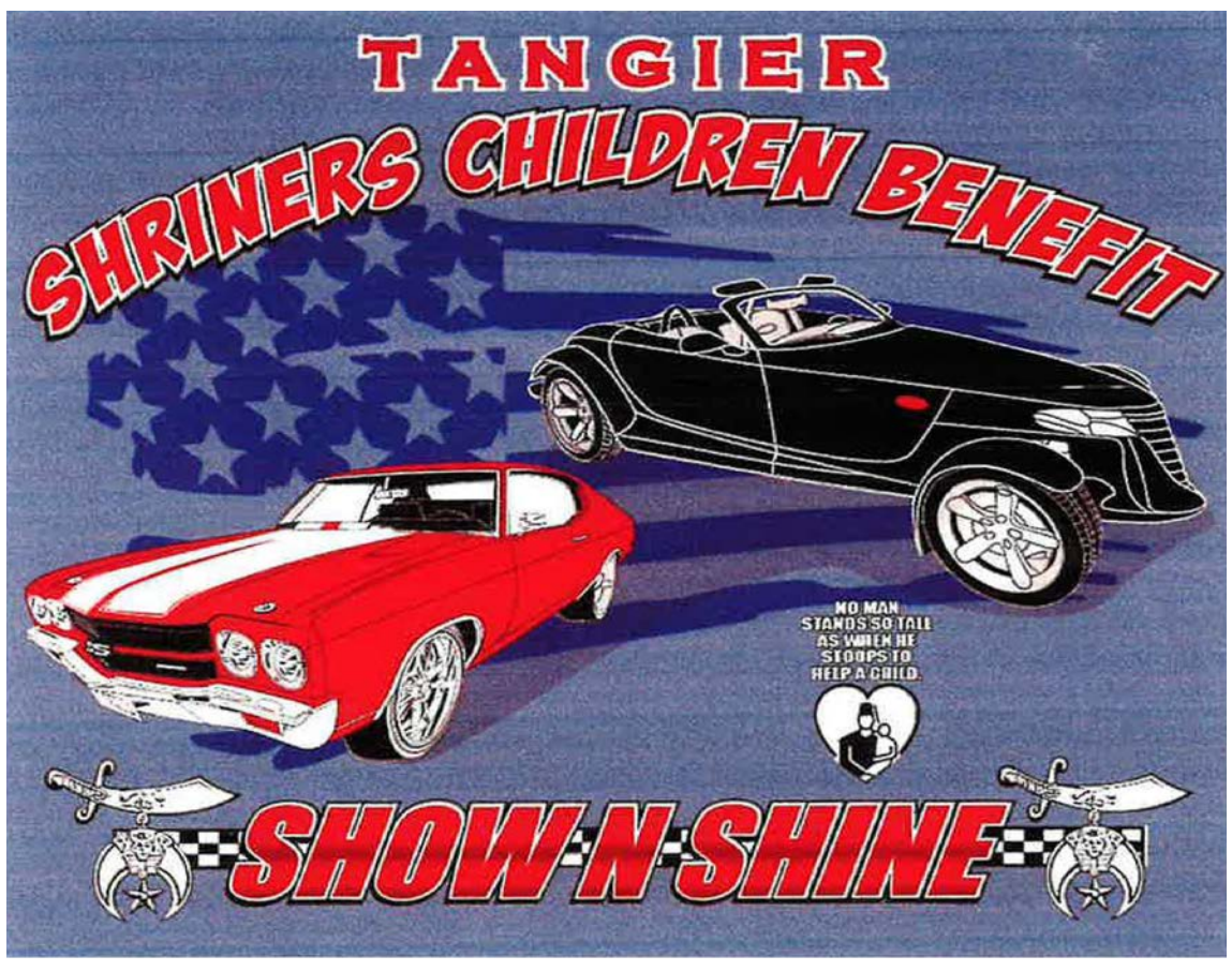
June 4, 2023

All proceeds go to the Shriners Hospitals for Children and are tax deductible.